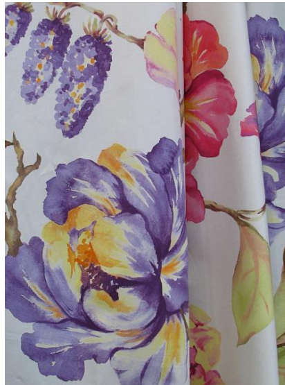
Jennifer's January Jots